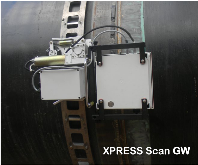
XPRESS Scan GW