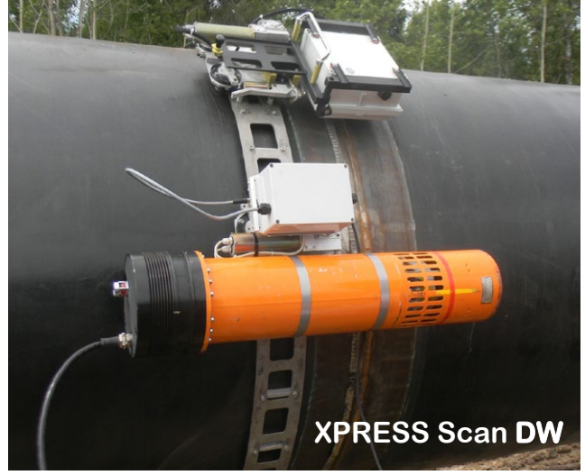
XPRESS Scan DW